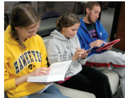
ENGLISH MAJORS READ IN A MULTITUDE OF WAYS.